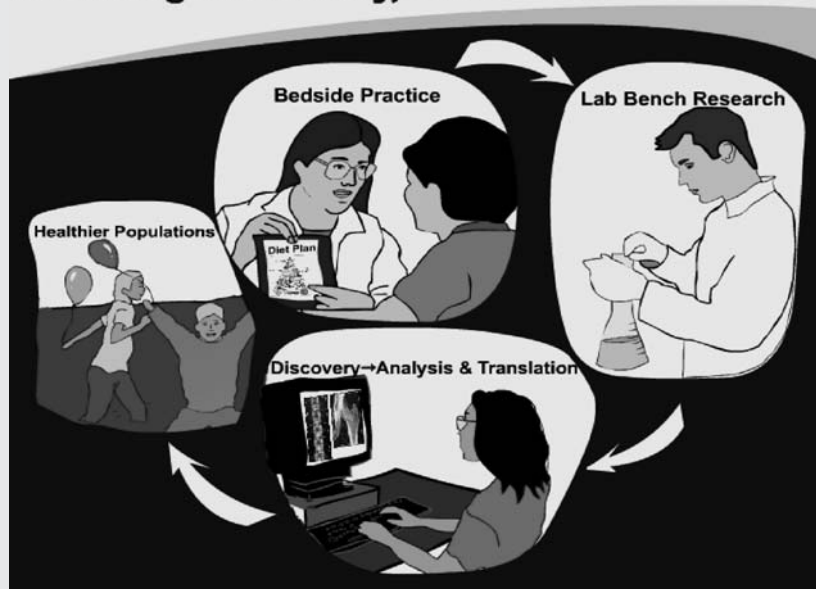
Figure created by S. Atkinson and F. Yousif, 2006

factors underlying the risk of bone abnormalities in this pediatric cancer. Additional longitudinal studies (9,10) and intervention pilot studies (11) provided further evidence of the magnitude of the secondary effects of chemotherapy on bone health, and possible avenues of treatment to attenuate the effect. Again, such discovery of knowledge could be easily translated back to bedside clinical practice.